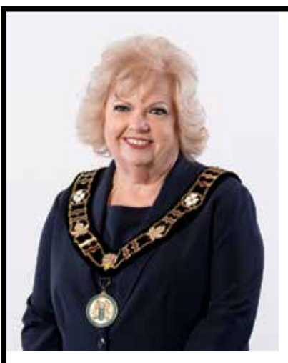
MAYOR BRENDA LOCKE